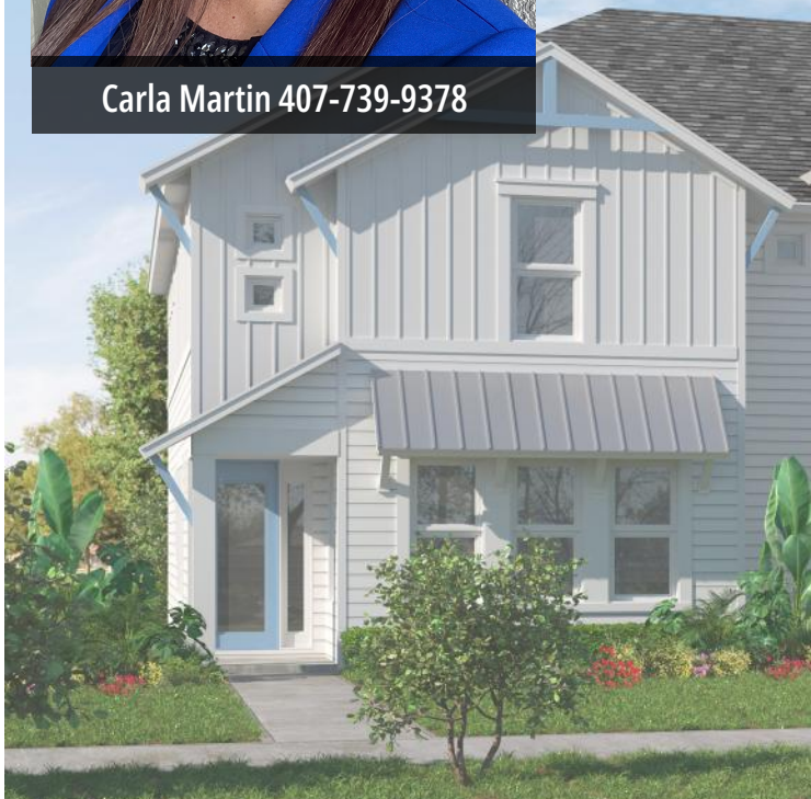
THE CASTILLO - C at NOCATEE