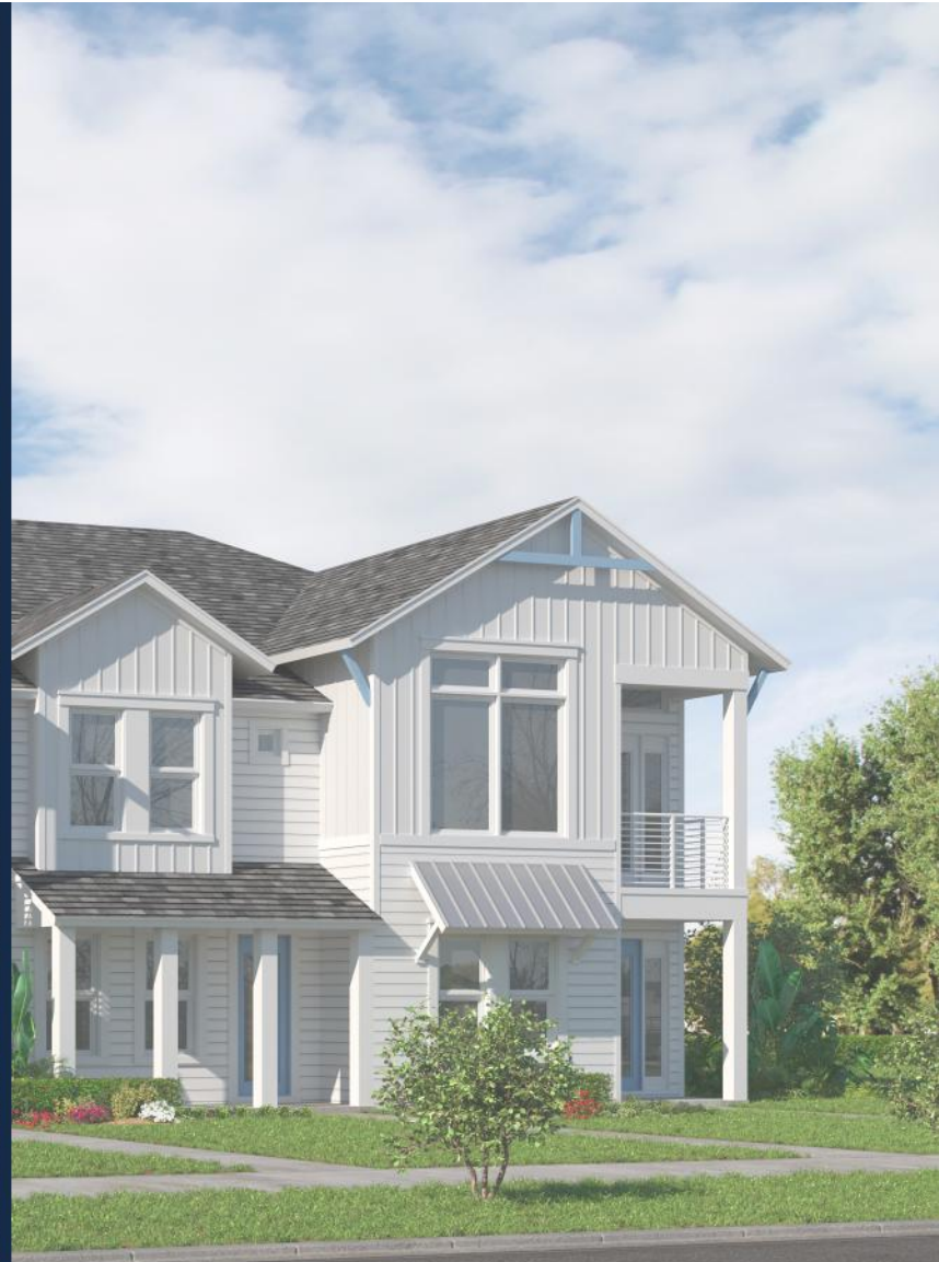
THE CASTILLO - FARMHOUSE

3 Bedrooms • 2.5 Bathrooms • 2-Car Garage • 1,680 ft 2 Living Area • 2,306 ft 2 Under Roof