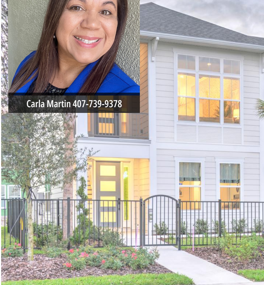
THE CASTILLO - C at NOCATEE