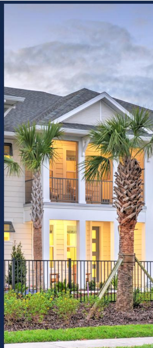
THE CASTILLO - WEST INDIES