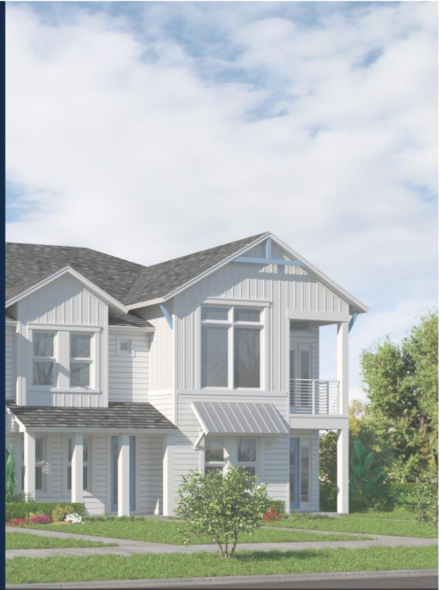
THE CASTILLO - FARMHOUSE