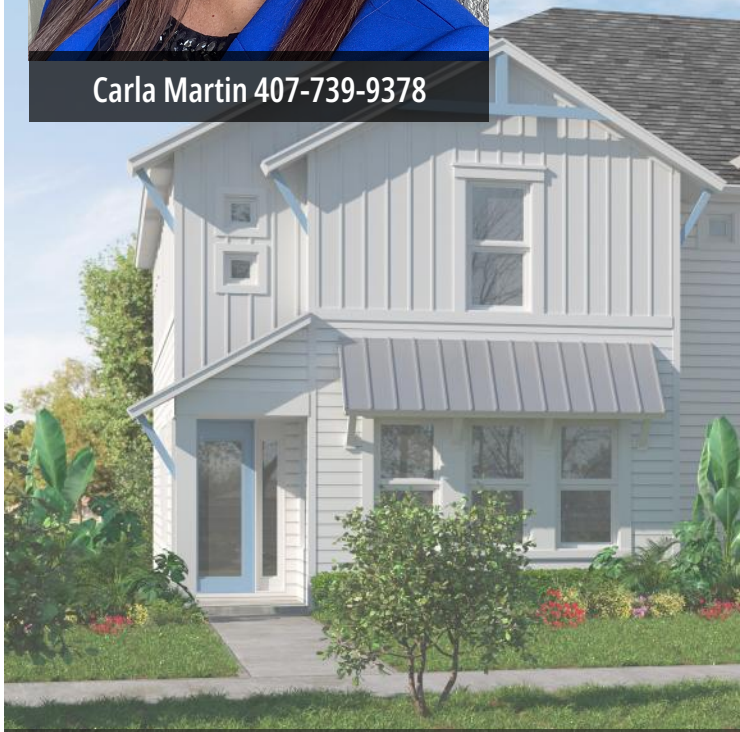
THE CASTILLO - C at NOCATEE