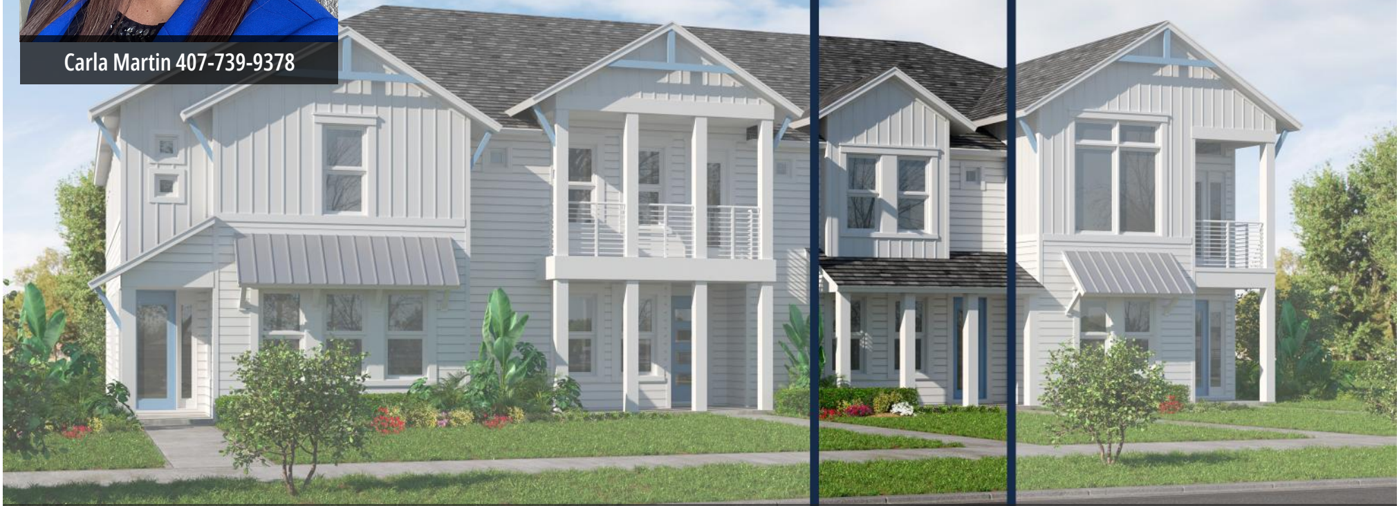
THE DELEON - D at NOCATEE